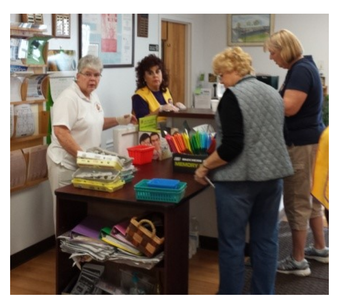
Preparing for Quarter Auction