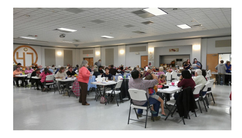
Harrington's Quarter Auction

And our own club Christmas party is coming up, where we take the opportunity to collect hats, gloves and scarves for the elementary school children in our community. We are also getting Christmas food baskets put together for our community,