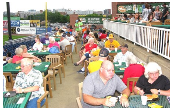
Glasgow Lions enjoying themselves in the picnic area