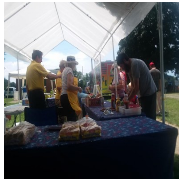
CLAYTON LIONS WORKING AT THE 4 TH OF JULY FUNDRAISER AT THE SMYRNA PARK