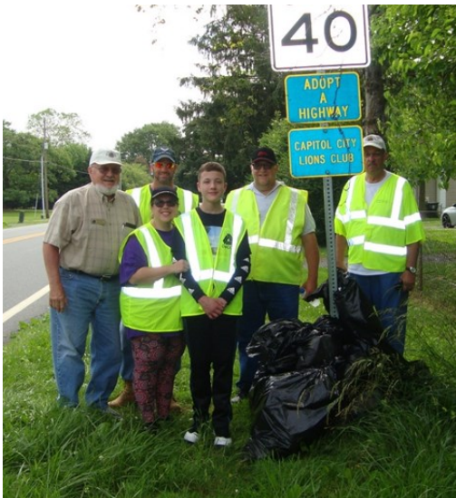
Road Clean-up on June 8th