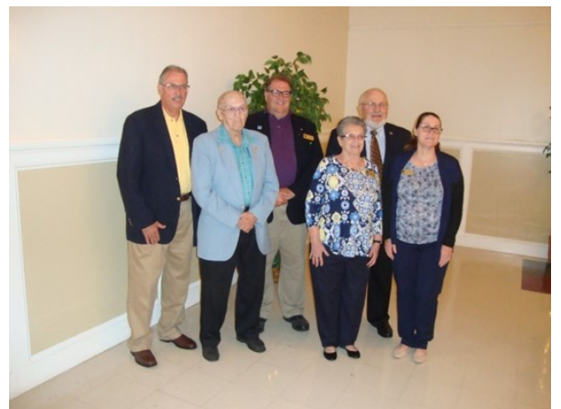
New Officers for the 2019-2020 Lion Year