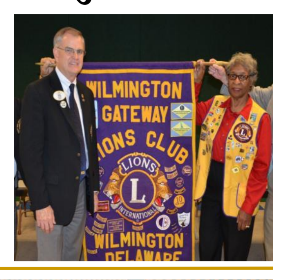
DG Visitation to Wilmington Gateway November 3