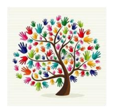
More Hands Grow More Service

In order to help with budgetary constraints and provide service to all Lions, the 2016-2017 Cabinet is continuing to charge for regular mail delivery of a Black/White copy of the District Bulletin.