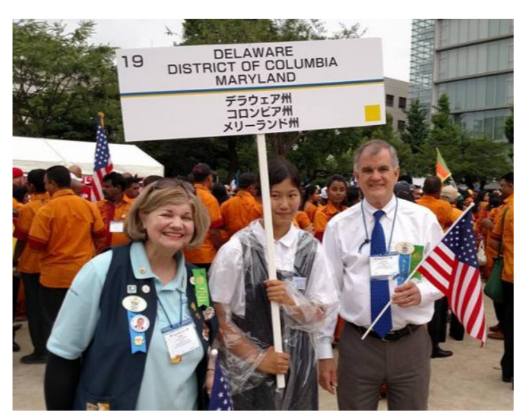
Ready for the Parade!