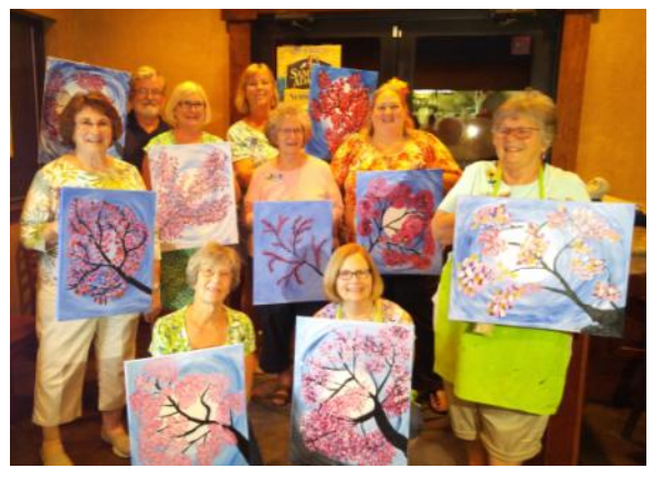
Some of the FSC Lions who painted on Monday July 13th, with their paintings.