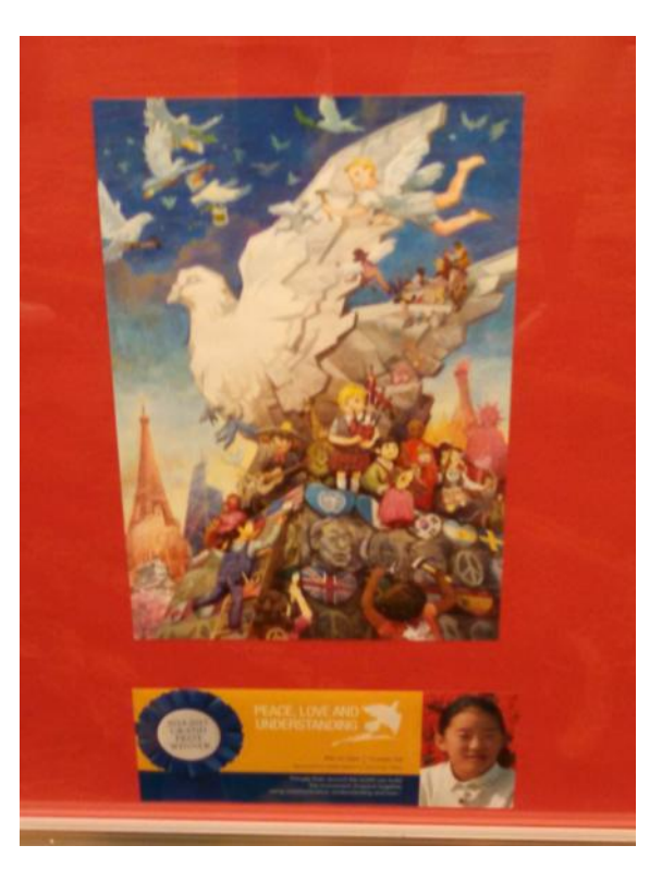
2015 winning Peace Poster