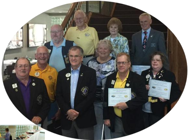
Waiting for classes to begin!

About 70 lions attended the Leadership School on June 10th at Delaware State University. Here are some pictures from the day.