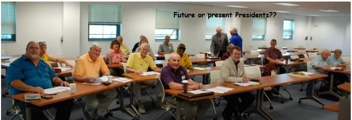
Future or present Presidents??